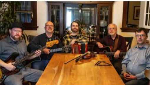
Le Travaillant, 1/22