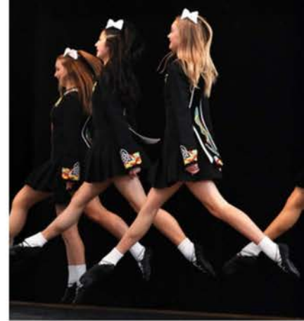
Trinity Irish Dancers, 3/15

Equal parts classical violinist and Irish fiddler, she's just as comfortable playing with the Illinois Philharmonic as she is playing jigs and reels at the local Irish pub.