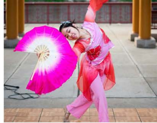
Yin He Dance Company, 2/15

Tuesday, February 10 | 7:15pm | Dole Hall